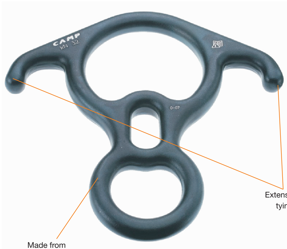
Made from Aluminium alloy

Constructed from aluminium alloy. For rope diameters from 9 to 16mm for double rope rappel; and up to 20mm for single rope rappel only.