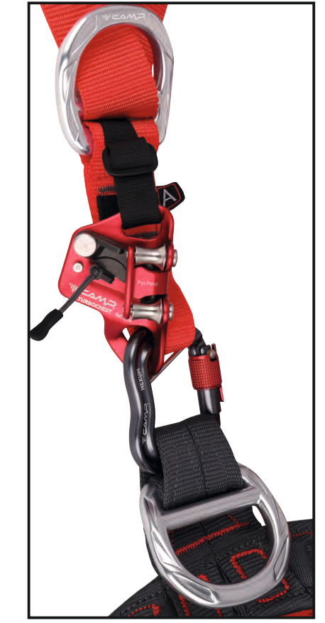
Space for inserting the Turbochest ascender