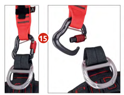
NEXUM CARABINER (see next page)